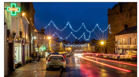
Roscrea Town Centre.