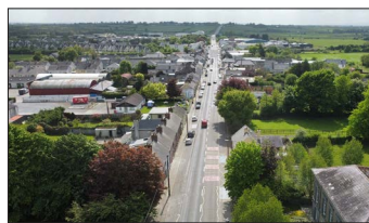
Urlingford, Co. Kilkenny.