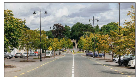
Strokestown Town Centre.