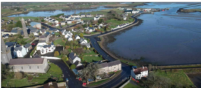
Killala, Co. Mayo.