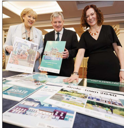
Minister for Rural and Community Development, Heather Humphreys, Minister of State for Local Government and Planning, Kieran O'Donnell and TCF National Co-ordinator, Mairéad Hunt at the launch of the Town Centre First scheme on 28 February.

Plans for 26 towns across Ireland are up and running under an initiative that aims to breathe new life into the town centres, tackle vacancy and dereliction as well as boosting business and tourism. The towns will receive government support with funding of €30,000 each to complete a comprehensive town plan under the Town Centre First scheme.