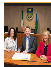
Mid-East Energy Climate Unit Page 77