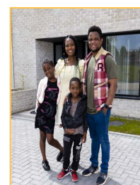
Clúid Housing Page 47