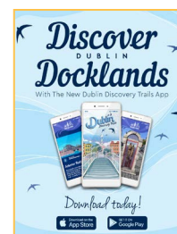
Discover Dublin Docklands App Page 69