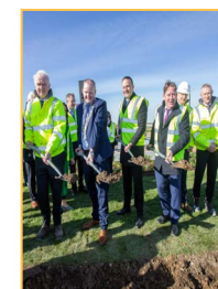
HISCo Page 39