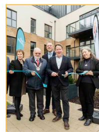
Meath County Council Page 51

The Northern and Western Regional Assembly's new six-year investment programme, totalling €217m in European Regional Development Funds (ERDF), has been launched for the region, which has been classified as a 'lagging industrial region' and a region that is 'in transition' by the European Commission.