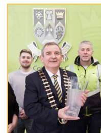
Clare County Council Page 28

Urban regeneration funding to the tune of €32m, secured by South Dublin County Council, forms part of an overall €110m development programme to deliver a series of enhancement projects across the Tallaght Town Centre, such as the Innovation Square and Centre and Tallaght Stadium.