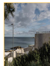
Dun Laoghaire Baths Page 86

Whilst every effort has been made to ensure that the information included is correct, the publisher cannot accept responsibility for errors, omissions or discrepancies. The views expressed are not necessarily those of the publisher.