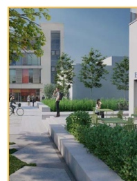
Tallaght Innovation Square Page 55