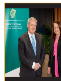
Tailte Éireann Page 37