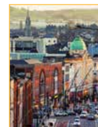
Local Government Award Winners Page 40