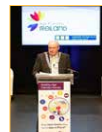
Age Friendly Programmes Page 45