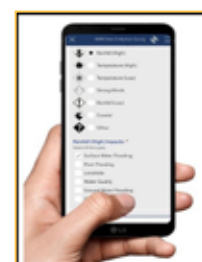
Weather Impact Register App Page 25