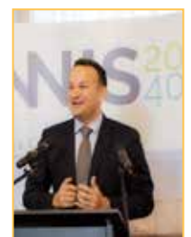
Ennis 2040 Strategy Launch by Leo Varadkar Page 73

Clare County Council’s new economic and spatial strategy aims to drive the economic, social and physical development of Ennis over the next 20 years, and to provide a basis for targeted investment, balanced economic growth and a sustainable spatial pattern of development with quality of life at its core.